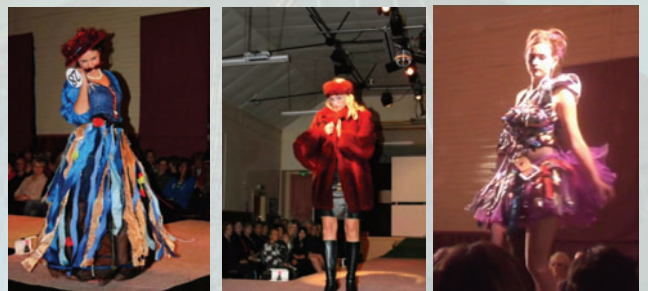
Stretton at Waihou: a sight to behold.