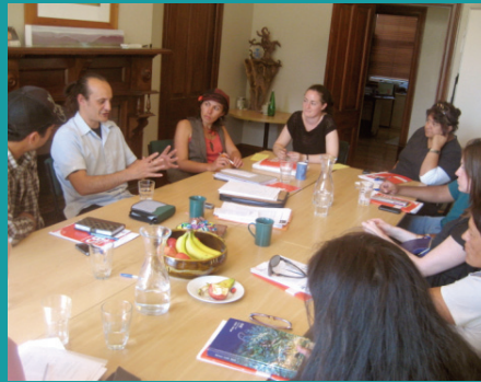
"Tukua kia rere"-writing workshop

Further follow up meetings with the artists will be held to develop profiles for the Taonga o Waikato website over the next few months, www.maoriartswaikato.co.nz , or contact waimihi@artswaikato.org.nz