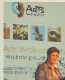
Arts Waikato Chairperson

Applications have opened for Arts Waikato's 2010 scholarships. Arts Waikato continues to support the development of individual artists, performers and arts administrators through the Arts Waikato Scholarship programme. We will fund course fees for recognised tertiary study or continuing education courses.