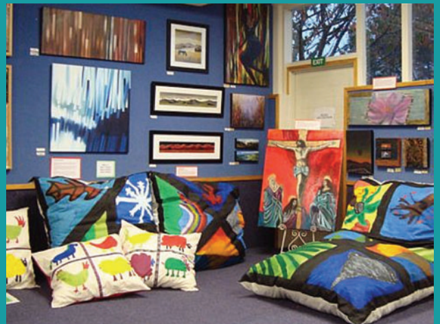
Children's art sat proudly alongside community artists' work at the Marian School art auction.

Linking artists with schools is another aim of the arts advisors and the next event on the calendar is a music intensive for the Western Waikato schools cluster. Local musicians will share their passion and skills with enthusiastic students for two full days. To learn more contact kerrie@artswaikato.org.nz or wanda@artswaikato.org.nz